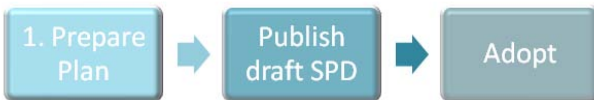
Figure 3: Main stages in preparing Supplementary Planning Documents

4.3 The processes for producing Supplementary Planning Documents (SPDs) are less rigorous as they are not part of the Development Plan and build on adopted policies in Local Plan documents. Figure 3 identifies the three stages and table 2 outlines the detail of community consultation. These stages are also applicable to the revision of the SCI, which is also a Local Development Document.