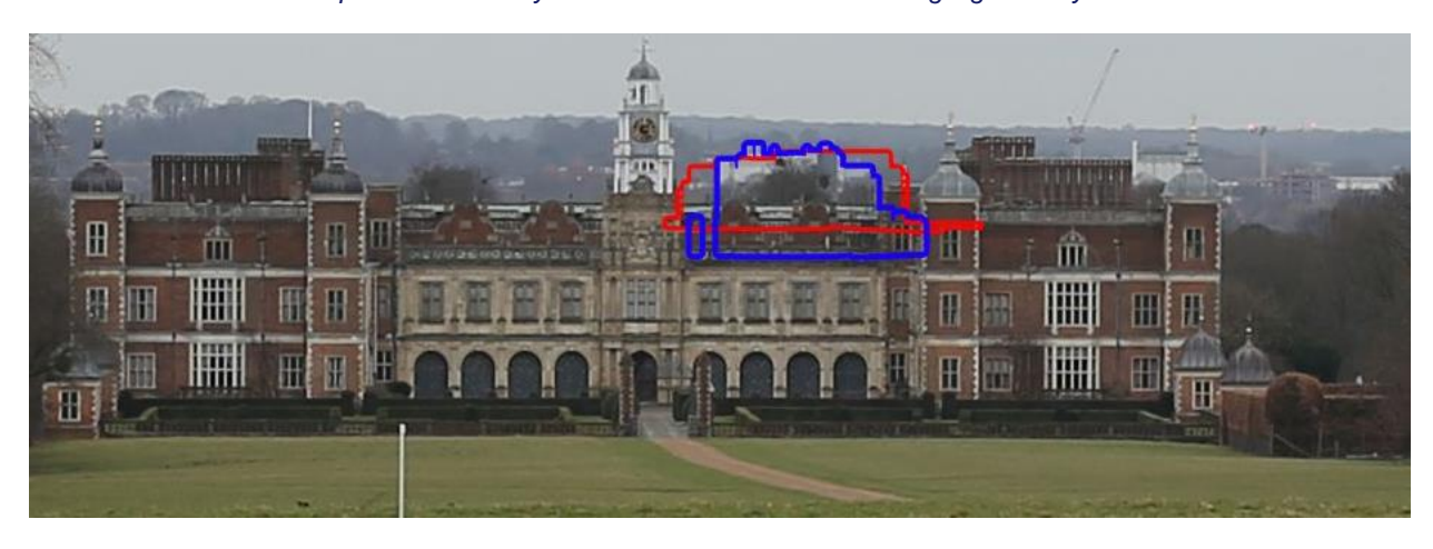
Figure 4. Magnified view of Hatfield House from the Southern Approach, with the existing massing of the site shown in Blue and Proposals shown in red.