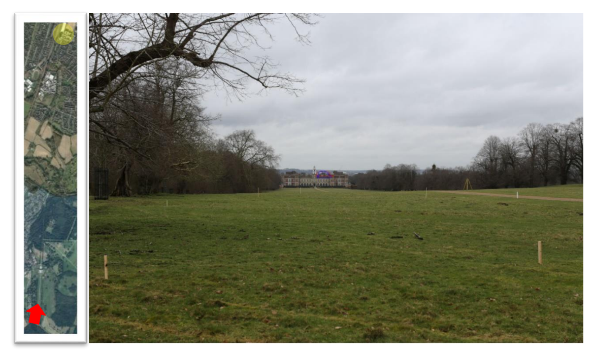
Figure 3. View from the southern approach within Hatfield House Park and Garden, looking towards the site over the house from a slight incline. The blue line indicates the existing building while the red line shows the proposed. Inset: viewpoint indicated by the red arrow while the site is highlighted in yellow.