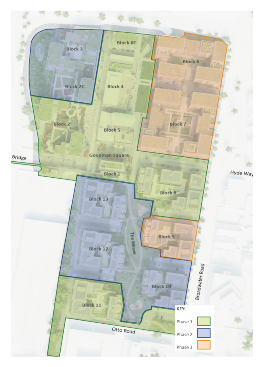
Figure 1 Extract from Design and Access Statement Collado Collins

3.2. The following extract from the Design and Access Statement (Collado Collins) shows the layout, position and phasing of blocks across the site. This will be in 3 phases with the listed building conversion, new square and community facilities provided first, followed by successive phases of residential completions.