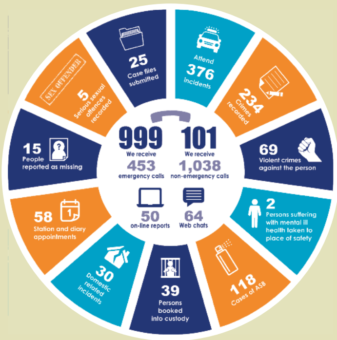
Average day in Hertfordshire